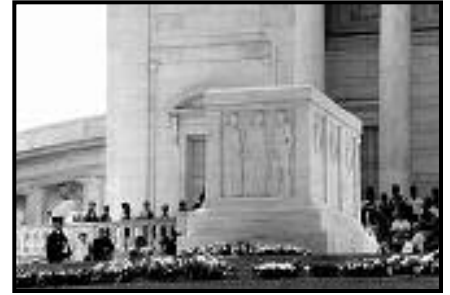
Above - "Tomb of the Unknown Soldier"